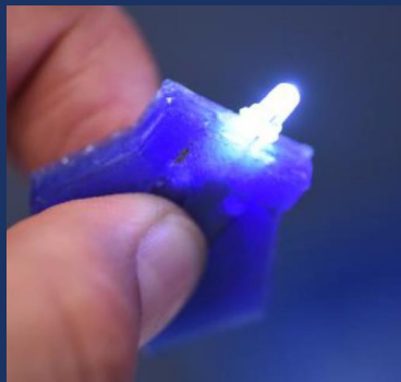
LED flashlight with printed wires leading to battery.

Don't add wires, print the wires of your device within the housing of your structure.