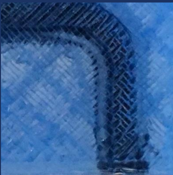
Embedded conductive ink 3D printed within PLA.

Print IoT packaging, sensors, antennas, resistors, conductors, and other electrical components. Try different functional pastes and inks to print your sensors